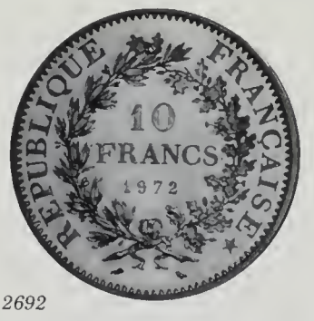
Lot No. 2692